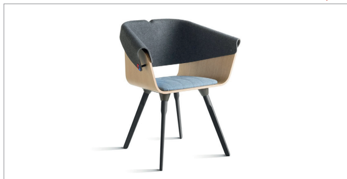
Chair PWCF-201: cast iron and wood base

The nametags on the side are melted en heatpressed bottlecaps.